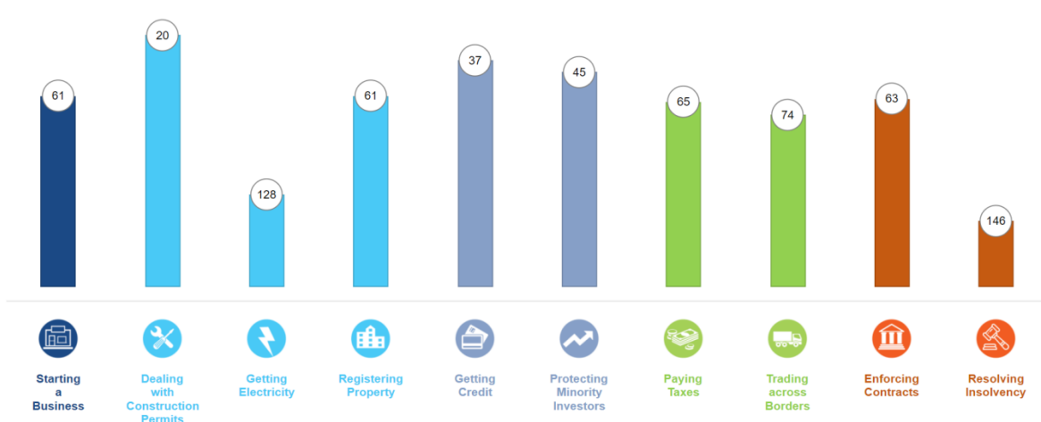
Rankings on Doing Business topics (1-190) - Ukraine